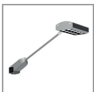
B 04 LED-Spotlight on cantilever arm