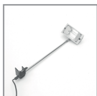
B 03 Spotlight on cantilever arm