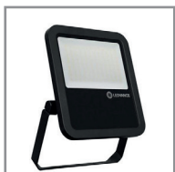
B 07 LED-Floodlight