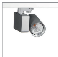
B 02 LED-Spotlight