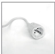
B 08 Socket