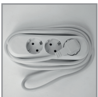
B 09 Triple socket