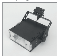
B 06 HQI-Spotlight