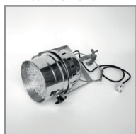
B 05 LED-Stage Spotlight